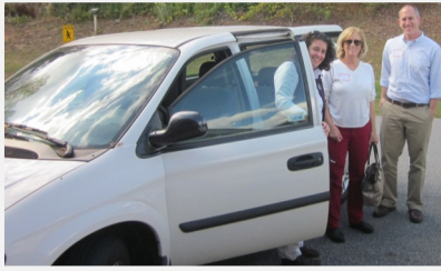
Campus Tour of University Participant at WCU!